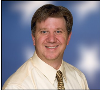
by Brien Szabo

My 2010 run for Town Council was an exciting time. It held many highs and a few lows. Still, it was an exhilarating experience I wouldn't