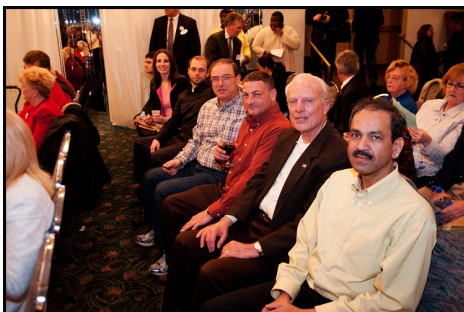
PRO members at the Convention.

The democratic process, including official ballot voting, was in full swing at the convention. As we embark on another election cycle, the PRO sends best wishes to all of the Republican candidates!